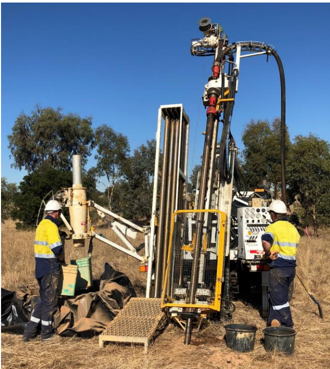
Figure 2: AC drilling underway at the Stawell Granite Gold Project