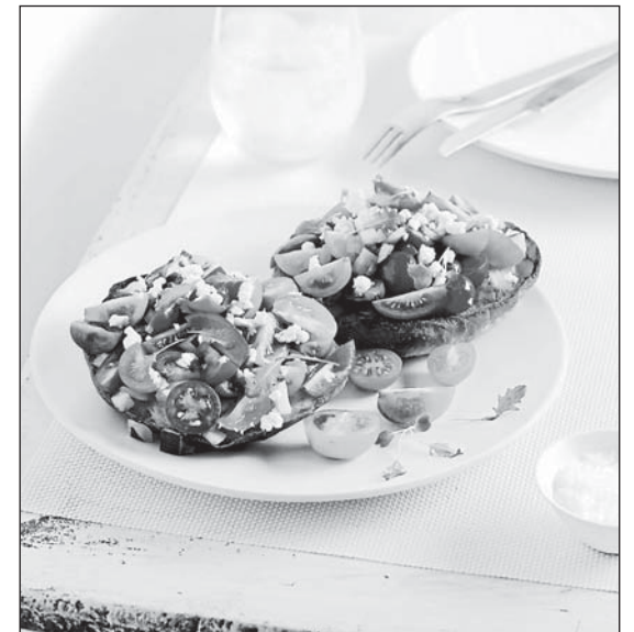
Caitlan's easy Bruschetta.