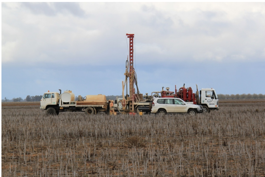
Figure 2. Air-core drilling at Tandarra Gold prospect